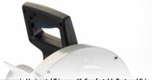
Ergonomic, Horizontal Trigger with Comfortable Textured Grip