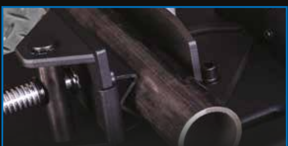
V-Block Clamp Included for Round Tube, Box Section